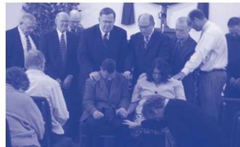
Victory Baptist installation prayer

their doctrinal positions and were both commended by their respective examination councils.