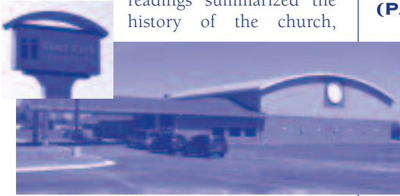
Kent City sign / New facilities of Kent City Baptist Church

— May 4 was a day of great significance in the history of Kent City Baptist Church. Not only did the church recognize 140 years of ministry in the Kent City community, it celebrated the dedication of its brand new facilities. A power point presentation and dramatic readings summarized the history of the church,