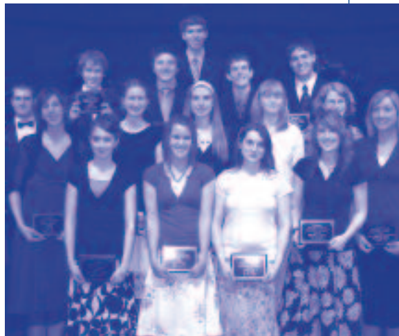
2008 MARBC Talents for Christ First and Second Place finishers

MARBC teenagers, parents, and churches gathered at South Baptist Church on Saturday, April 19, for the annual MARBC Talents for Christ competition. Talents for Christ (TFC) helps teens in grades 9-12 to develop their God-given talents for ministry within the local church. It encourages students to prepare and to gain skill for serving the Lord. Expanded competition for this year's event included three new categories – Art and Media Design for individual competition and Vocal Duet for group competition. Additionally an "Open Division" was created that allows everyone in the youth group to participate and develop their God-given talents for ministry within the local church.