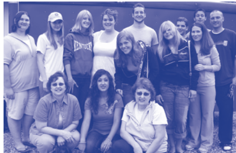
Orangeville Baptist Church DVBS mission team

blind. They are currently at the 30% support level and are eager to present this special ministry in churches. Rory is also available to assist churches in how to set up a budget.