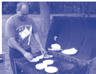
A new Baptist picnic idea – tortillas!