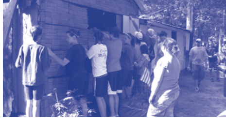
Calvary Owosso renovation team

could not understand why a group would travel all the way from Michigan and be such a blessing to their family.” Towards the end of the week, the group also enjoyed some free time, including whitewater rafting down the Shenandoah River in Virginia and floating on tubes down the Potomac River in Maryland.