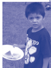
Every Baptist celebration has to include food!