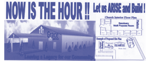
Grace Hispanic Baptist Church building plan