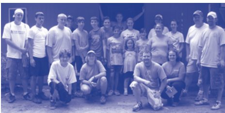
Calvary Owosso youth missions team