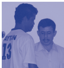
Baptismal service at Grace Hispanic celebration