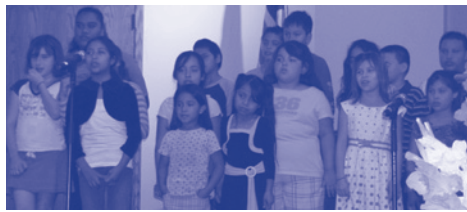
Children's choir at Grace Hispanic celebration