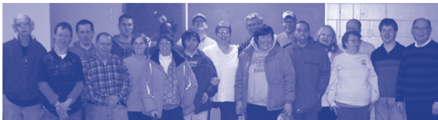
The Friends Club at North Park Baptist