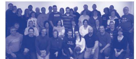
Couples retreat participants