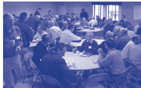
Fellowship was a special part of the seminar