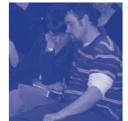
Couples retreat prayer sessions